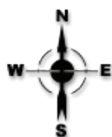
Sketch Floor Plan

Land Size _____ No. of Rooms _____ Construction - Roof _____ Walls _____ Water Pressure _____ No. of Bathrooms _____